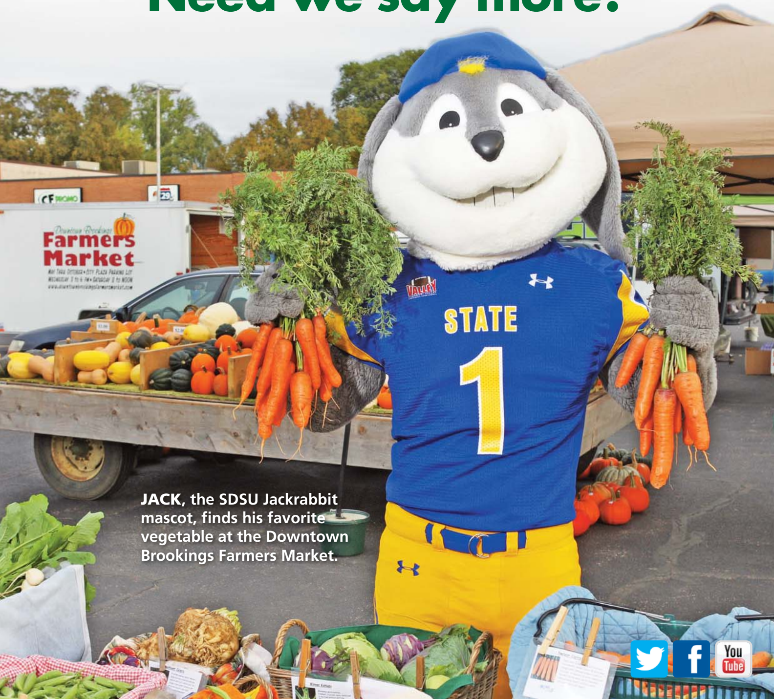
JACK , the SDSU Jackrabbit mascot, finds his favorite vegetable at the Downtown Brookings Farmers Market.