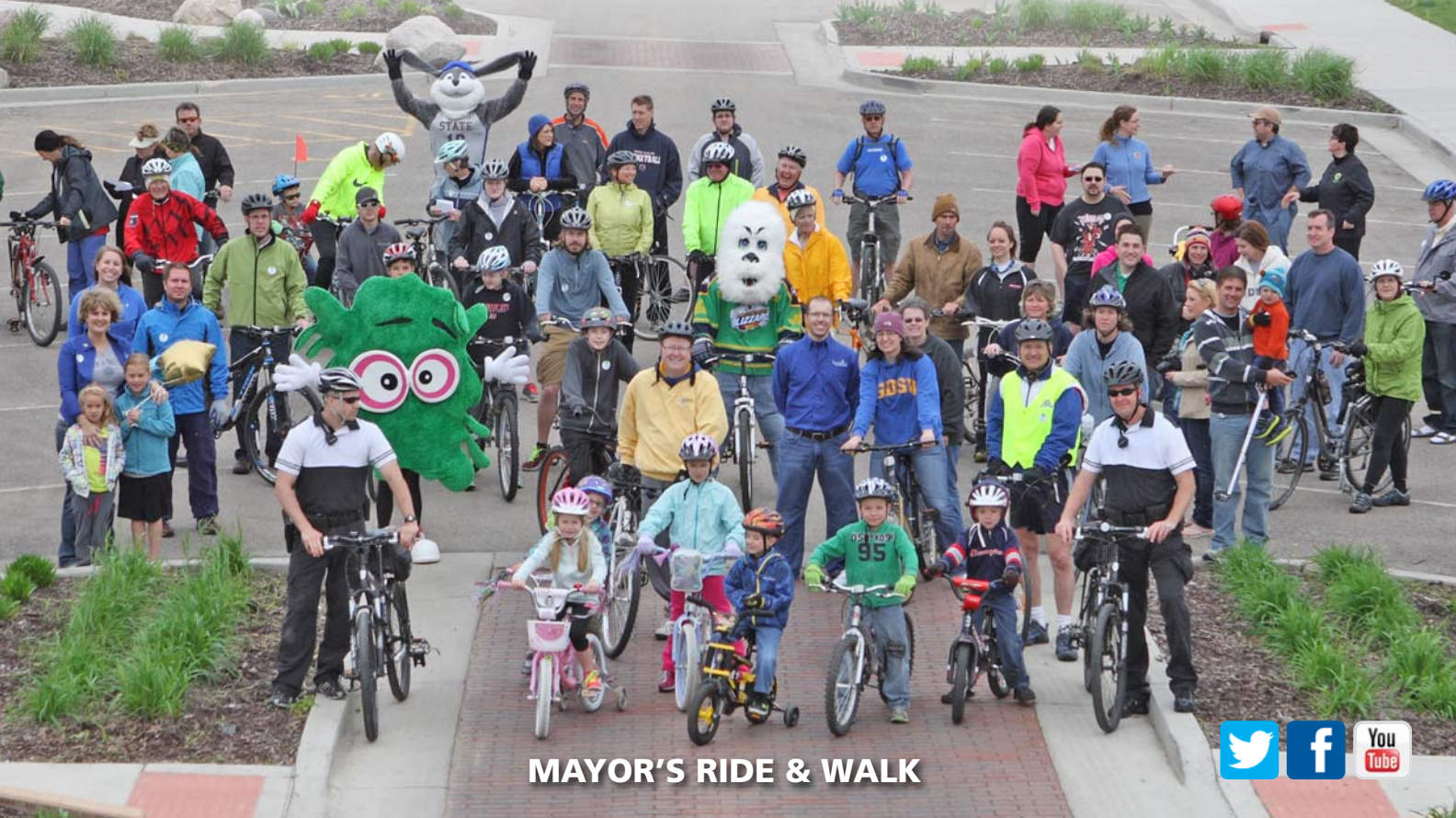
MAYOR'S RIDE & WALK

Social sustainability supports current and future generations in creating healthy and livable communities – diverse, connected, and democratic – that provide a good quality of life.